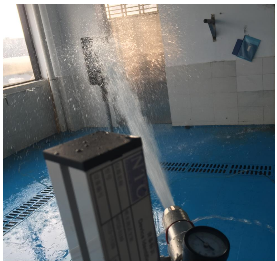
Fig.2: IPX6 testing