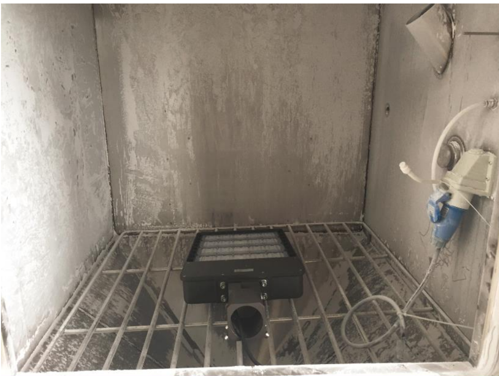
Fig.1: IP6X Before Testing