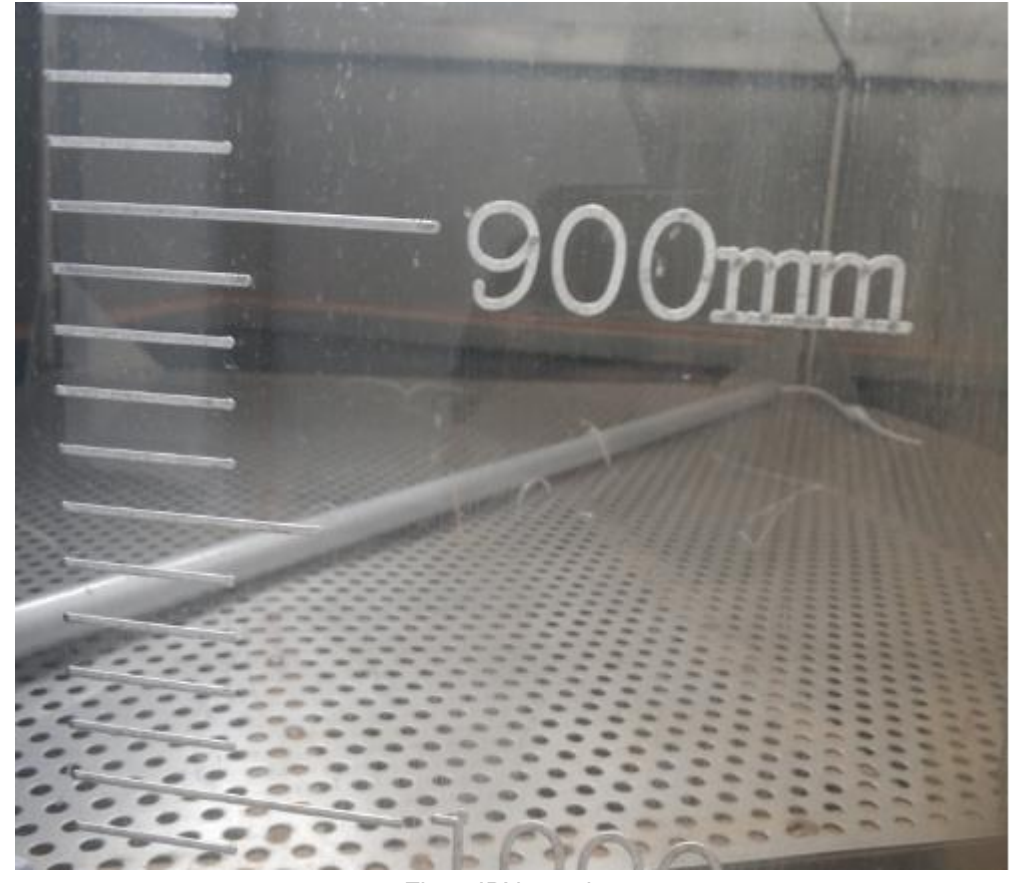
Fig.4: IPX7 testing

TRF No.: IEC 60529 Page 9 of 10 Ver.:1.0