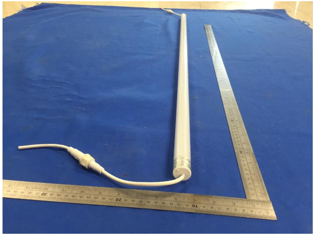
Fig.6: Side Photo