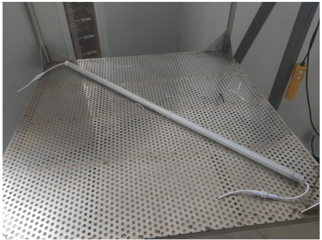
Fig.3: IPX7 Before Testing