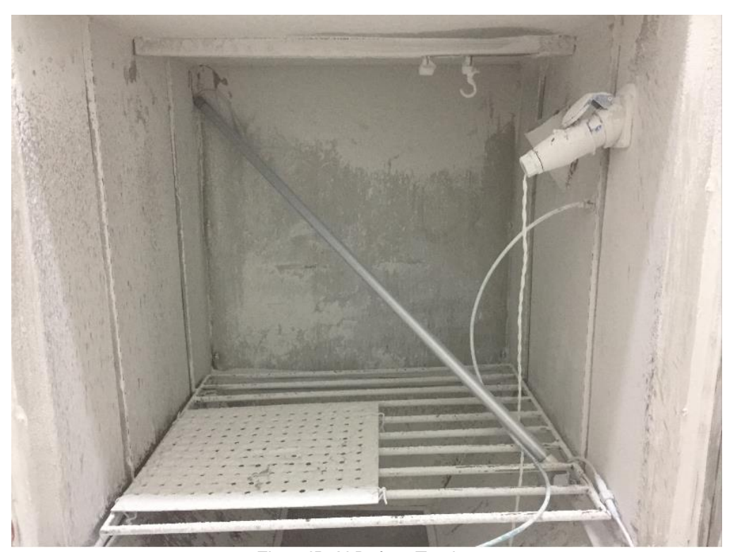
Fig.1: IP6X Before Testing