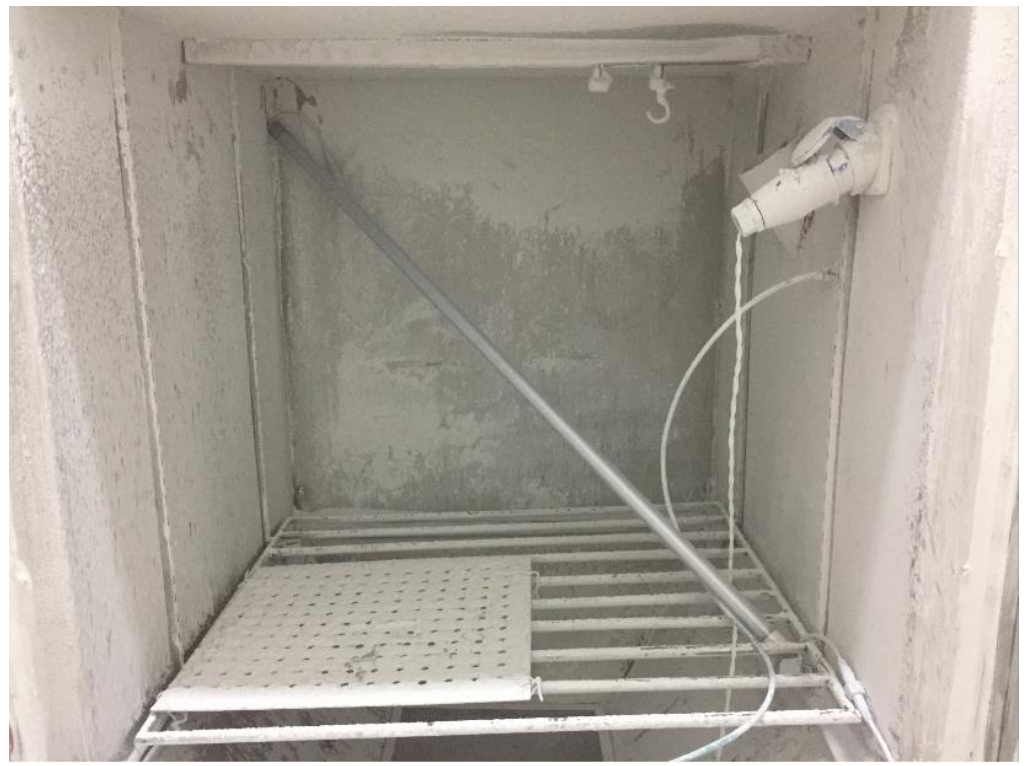
Fig.2: IP6X Post-testing