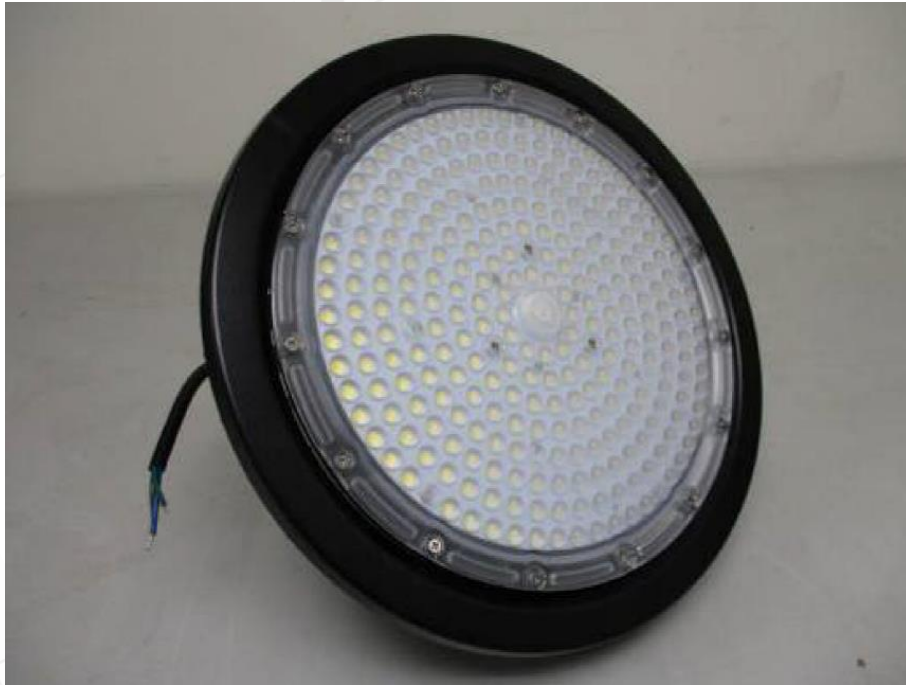
DUT Front View